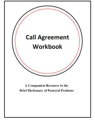
Order from uccresources.com

Familiarize yourself with tools conference is providing Search to Committee. The Call Agreement Workbook contains a sample Scope of Work for pastoral positions, which might prompt conversations about the church's expectations of its pastors. You might field general questions about the ministers capabilities are expected demonstrate, as outlined in the Marks of Faithful and Effective Authorized Ministers. Processes of support and oversight of ministers evidenced by associations, as UCC